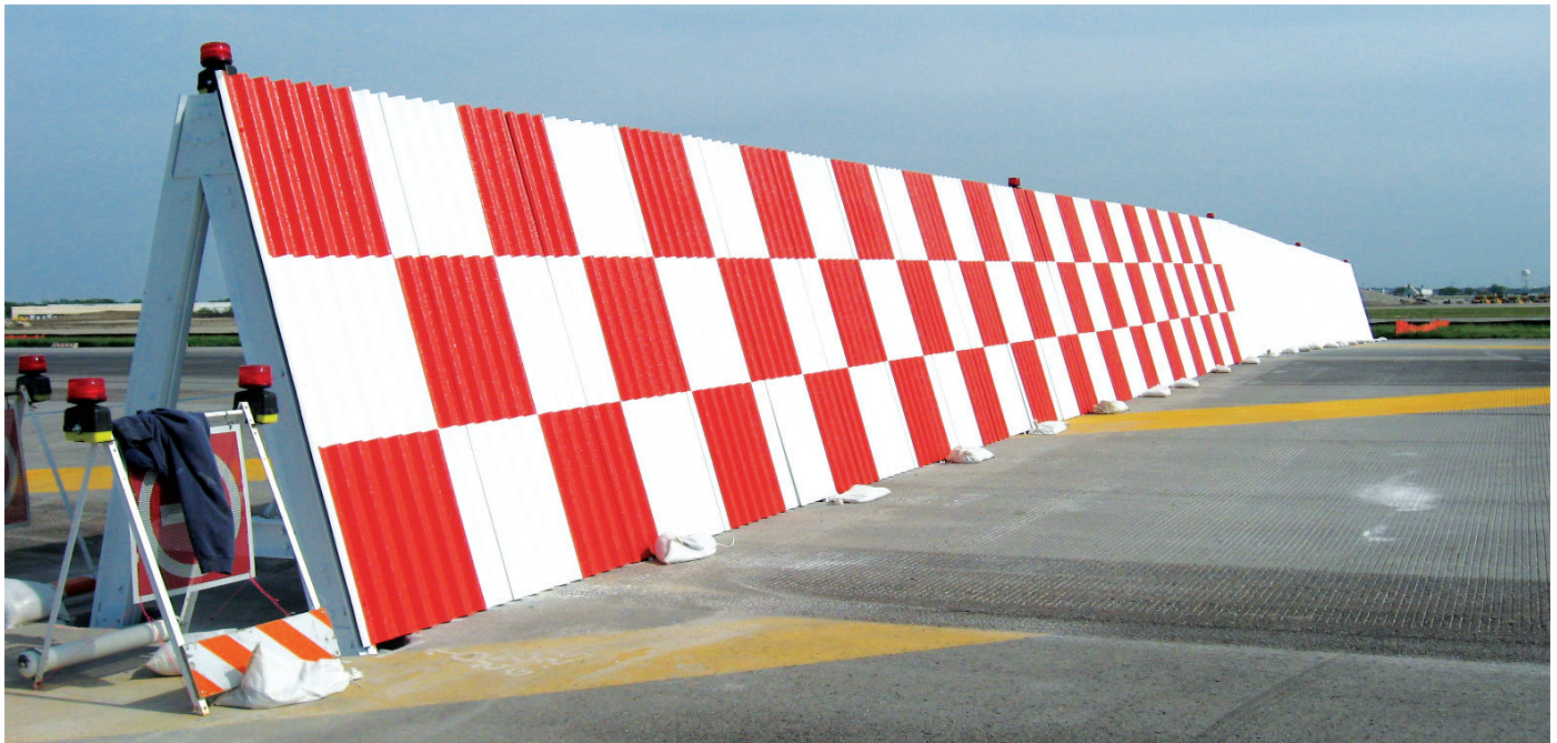
Runway 10-28, Chicago O'Hare, 2009

Chicago O'Hare International Airport: In 2009, runway 10-28 was shortened by approximately 3,700 feet and a frangible barrier was placed on the closed portion of the runway to protect a localizer antenna array (see photo below).