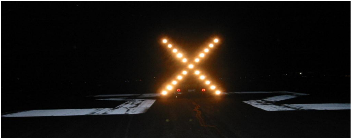
Figure 2-4 Lighted X at Night

(3) Partially Closed Runways and Displaced Thresholds. When a runway is partially closed, a portion of the pavement is unavailable for any aircraft operation, meaning taxiing and landing or